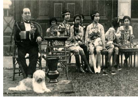
Fig. 5 Women's participation in social activity [11]

The analysis results of King Rama VI's initiation in terms of art and culture disclose the relevance of the theory of modernization especially the state of being up to date in line with western countries. For example, during the flashback of the popularity of traditional handicraft in western countries, in Thailand there was also flashback of the rehabilitation of traditional Thai art and culture to show the national identity and the prosperity of Thai culture, which has been passed on recently. In terms of the definition of culture under the conceptual framework of European Empire Period, since culture was defined as modernization or westernization, Thailand had to show its high standard of culture in accordance with western criterion by creating art and cultural artifacts based on western value and by implanting the practice of gentlemanly behavior among the citizen. Meanwhile, the support of Thai women's status in accordance with that of western countries was also implemented by the change of Thai men's misconception concerning multiple marriage life with more than one wife, the superior of Thai male over female, and the encouragement of women's participation in social clubs and formal school education.