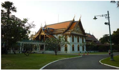
Fig. 2 The traditional Thai style building [2]

Thai art in terms of its appearance and its concept deriving from the belief of Tri-phases including planning, shape and elements. However, later on King Rama VI had an initiation to rehabilitate traditional Thai architecture and art.