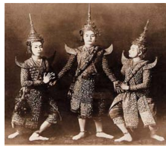
Fig. 1 The traditional Thai performing art [1]