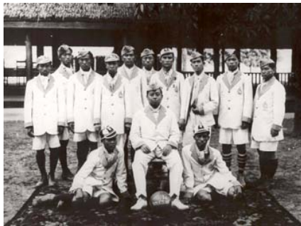
Fig. 4 King Rama VI and the football team [10]

Another activity designed to train men to have gentlemanly behavior was battle exercising and sports competition among members of the Scouts with the purpose of creating unity among members due to His Majesty's initiation about the lack of unity among civil servants [9]. The Scouts was established to serve the king's initiation to solve the problem by requiring the civil servants of all departments to come together to have battle exercises. The successful outcome of this activity was the elimination of the sense of divide among different levels of officials from different working units. Since every member had to respect commander of each level, and His Majesty was commander in chief, this resulted in the acquisition of being loyal and nationalism.