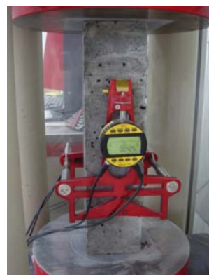
Fig. 2 Measuring of static elasticity modulus

Consistency of fresh concrete was determined in the category S3, i.e. within the range 100-150 mm of slump. Test specimens were made from individual mixes to determine properties of hardened concrete. Testing cubes of side 150 mm were made for compressive strength test and testing beams of dimensions 100 x 100 x 400 mm were made for static elasticity modulus test. Test specimens were placed in laboratory conditions until the time of testing. Tests were carried out after required periods, i.e. 7, 28 and 180 days. Static elasticity modulus was determined in accordance with CSN ISO 6784 [8].