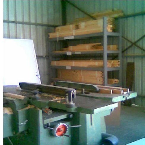
Fig. 5 5S application to woodworks area

In 5S application to the defined 10 areas at Prefab facility, it was necessary to develop a 5S checklist based on the 5S practical guide discussed earlier. The check list helps identifying opportunities and techniques for 5S successful and comprehensive application.