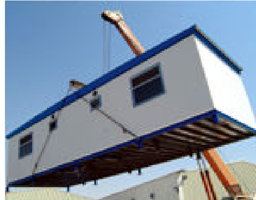
Fig. 1 Sample prefab product

This project is aimed at analyzing the workflow and improving workstations at a Prefab factory in Amman. The facility produces prefabricated structures such as portable buildings, homes, offices, and communication shelters. Figure 1 shows an example of the facility prefabricated products.