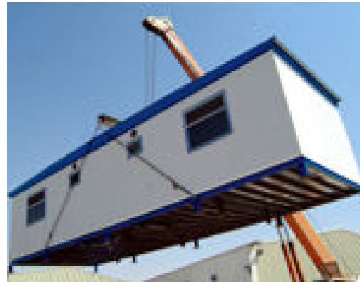
Fig. 1 Sample prefab product

This project is aimed at analyzing the workflow and improving workstations at a Prefab factory in Amman. The facility produces prefabricated structures such as portable buildings, homes, offices, and communication shelters. Figure 1 shows an example of the facility prefabricated products.