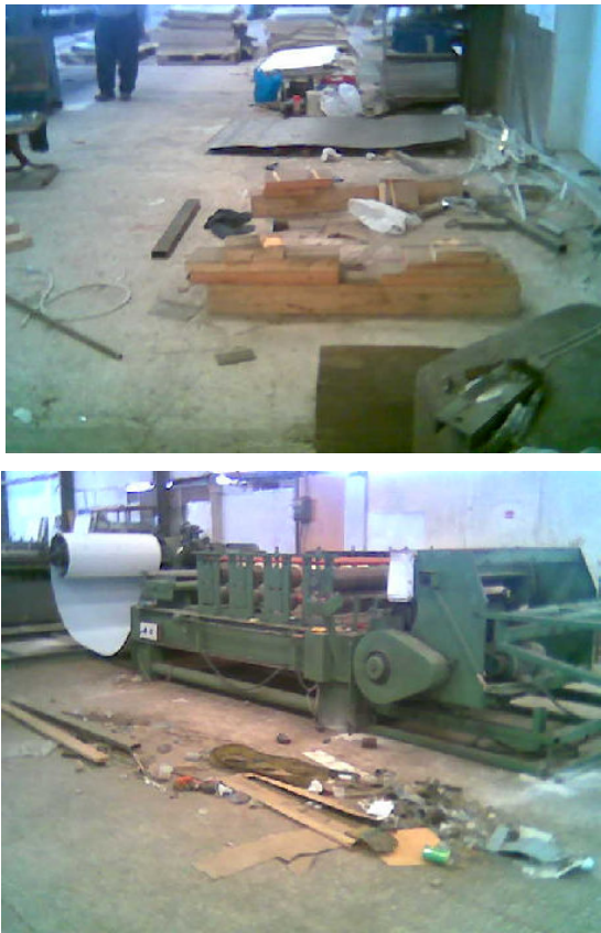
Fig. 2 Examples of waste and on-floor inventory

product variability while maintaining clean and organized work environment and controlled floor operations. Figure 2 shows examples of process waste.