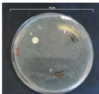
Fig. 1 Evaluation of the inhibitory effect of SDF on S. mutans : A) Resin-based fissure sealant without SDF incorporated (control); B) Resin-based fissure sealant with 12 % SDF solution and C) Resin-based fissure sealant with 30 % SDF solution

inhibited the bacterial growth after 24 hours. The determination of the inhibitory halos surrounding the samples was assessed. In the sample containing the resin-based fissure sealant with 12 % SDF solution (sample B) the inhibitory halo had a diameter of 1.06 cm while the sample containing the resin-based fissure sealant with 30% SDF solution (sample C) had a 0.89 cm inhibitory halo (Fig. 1). Therefore, no statistically significant differences were found between the inhibitory halos obtained for samples B and C. Moreover, SEM images of the surfaces of the materials were also acquired in order to fully characterize bacterial growth on the materials surface (Fig. 2). As it can be seen, no bacterial growth was noticed on the surfaces of the materials. The authors found that the cured sealant containing SDF had an inhibitory effect on the growth of S. mutans , but also the control sample (sample A) did not show any detectable bacterial growth. Further studies have to be done in order to check the antibacterial activity of the produced materials.