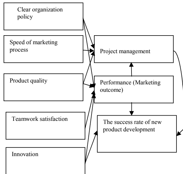
Fig. 1 Conceptual Framework

percentage, mean, standard deviation as well as t-test. The conceptual framework is shown in Fig. 1.