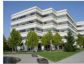
Fig. 1 The building of the Bishop-Ranch

In order to supply complete control on the construction method, the park has set the principles of the exact urban design containing the situation and limitations of the constructions and this park has been established in an area about 585 acre (see fig.1 & fig.2).