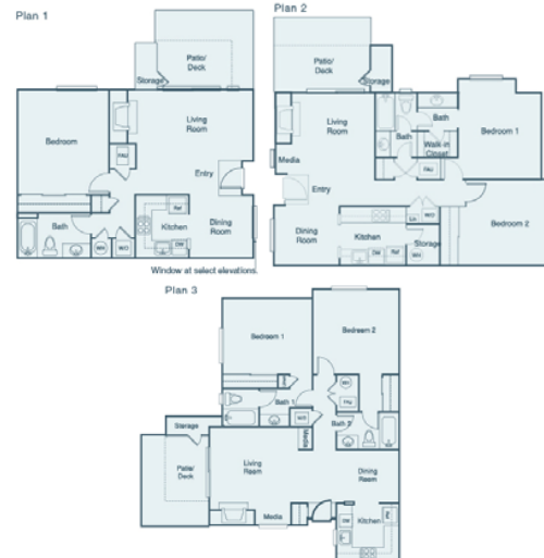
Fig. 2 Floor plan of the Bishop-Ranch