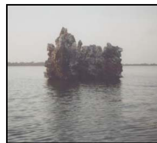
Fig. 3 Pedra da Confusão

The Araguaia National Park, a federal site of integral protection of natural resources, lies within the municipality of Lagoa da Confusão. It is located in the Bananal Island (considered the largest river island in the world), with a total area of 562 312 hectares. It incorporates 370 000 hectares of the Boto Velho Indian Reservation.