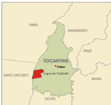
Fig. 1 Lagoa da Confusão location map

The territory of the municipality has an area of 10,564.661 km 2 and 11.859 inhabitants. It is situated in the western region of the State of Tocantins, Brazil, at the geographical coordinates 10°47'37"S latitude and 49°37'25"W longitude, on the right bank of the Araguaia River. The city is 184 km from the State capital of Palmas [7].