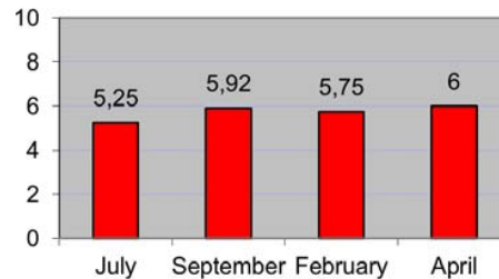
Fig. 5 Trajectory indicator TCLE

To do so, the businesses just have to offer varied services and more affordable prices in an attempt to encourage the tourist to bring from their hometowns the minimum possible, encouraging him to spend money in the city. That way, there will be a greater money flow on site. This result indicates that the visitor tourist in the city has contributed to the local economy, but that is not a significant collaboration. The local tourism depends on the seasons and a very small flow has been demonstrated.