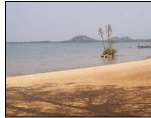
Fig. 2 Lagoa da Confusão

and flora of the cerrado vegetation and the Amazon rainforest. The main tourist attraction of the city is the lagoon (see Fig. 2), with 4.5 km in diameter, maximum depth of 3 meters, a diverse vegetation and marshy formations, surrounded by shallow waters and fine sandy beaches. It features a large rock (see Fig. 3), as mentioned previously, catches visitors' attention and curiosity.