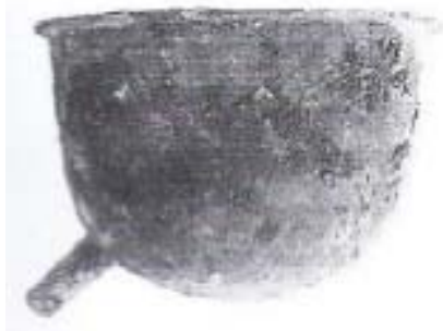
Fig. 3 Copper enema of Uah-ib-Ra [5]

In this research, the clyster belonging to the prophet of Amen Uah-ib-Ra (Fig. 3) has been used as main reference, due both to the parallelism and the extensive documentation, as well as the aforementioned copper reproduction of this object made by Janot [10].