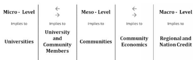
Fig. 2The significant level of the benefits generated to different stakeholders

This paper indicates the advantages generated by the concept, observed through a preliminary project, divided by the level of theory into three main different levels, namely Micro - Level, Meso - Level and Macro - Level. In each level and in between levels, the concept generated the advantages to deferent stakeholders, either directly or indirectly, as could be seen in figure two.