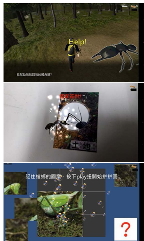
Fig. 3 Puzzle-solving images of the game

in the correct location to complete the task. The puzzle game was utilized to help students observe an insect's physical features and anatomy. Students must position tiles in the correct location to complete each task.