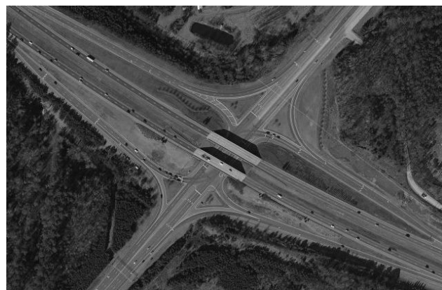
(b) Tight diamond