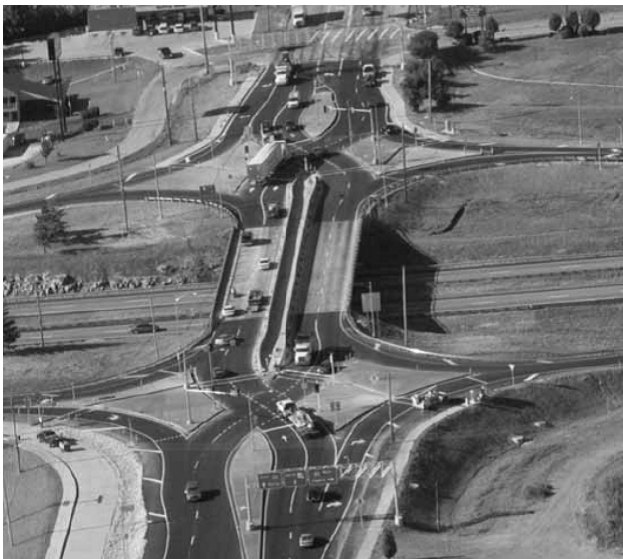
Fig. 2 First DCD in the US in Springfield, Missouri [1]

The first three DCD interchanges were installed in France in the 1960s and 1970s [1]. Fig. 2 shows the first DCD in the US, which opened in Missouri in 2009. There are now about 20 DCD interchanges open in the US.