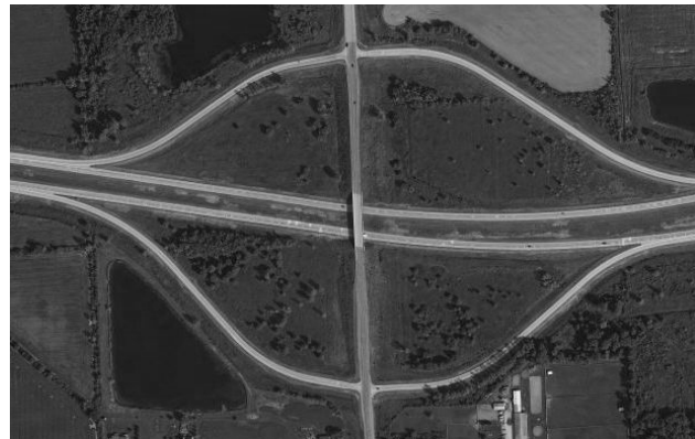
(a) Spread diamond