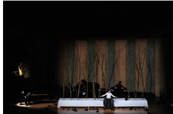
Fig. 9 Michael Borremans' Winterreise , 2014, stage performance

work whose publication does honour to the poet, the composer, and the publisher. Schubert has displayed a genius in his interpretation of the poet. He has truly appreciated the emotions expressed in these poems and reproduced them in music which none can sing or hear without being deeply moved [14].