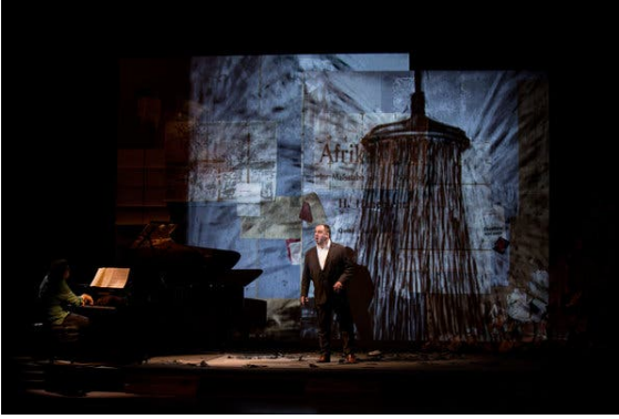
Fig. 1 William Kentridge, Winterreise , 2015

The South African artist, in an interview for the New York Times , said: “This “ Winterreise ” is a “celebration of incomprehension,” a defense of the “half-understood” [2]. Nothing is only what it seems to be. William Kentridge was seduced by German Lieder since childhood though he did not understand the language. He was compelled by the composition and – when invited to create his version – recovered his childhood memories and turned it into black and white images produced in a cinematic mood for the stage performance.