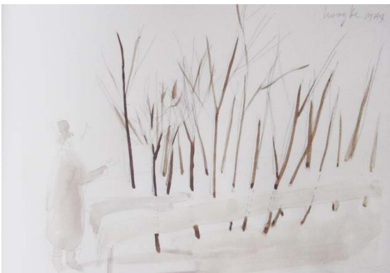
Fig. 5 Michael Borremans, Winterreise , 2014, painting

The aesthetic experiences are developed thru unexpected energies which emerge according to the empathies the artist or composer discovers. The process of creation implies research and emotions connected in harmony, accomplishing a journey the author wants to apply for. We could say that almost every artistic creation develops from a winter journey [ Winterreise ], as an ultimate journey that leads and – at in parallel - runs against dead and oblivion.