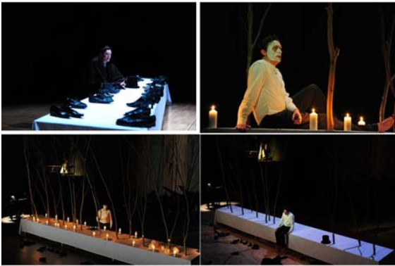
Fig. 8 Michael Borremans, Winterreise , 2014, stage performance

Michael Borremans and William visualized Schubert's Winterreise according to their aesthetic and conceptual principles without betraying the original poetic Masters.