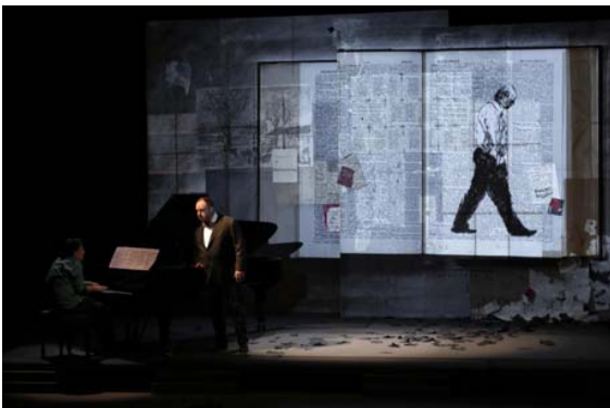
Fig. 10 William Kentridge, Winterreise , 2015, stage performance

Maybe the passionate effect of the singer performing on stage, the outcome of his overwhelming voice in a visual moving scenery leads to its crucial outcome. The whole environment increases reactions and passions towards a highest compulsive adherence. Maybe, all along these centuries, although the known differences in society, people still feel the pursued drama - loneliness, nostalgia, delusion and melancholy - with quite similar intensity (and urge).