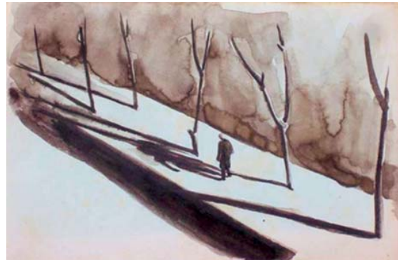
Fig. 3 Michael Borremans, Winterreise , 2014, painting

connaître le monde sans sortir de chez soi 1 [3].