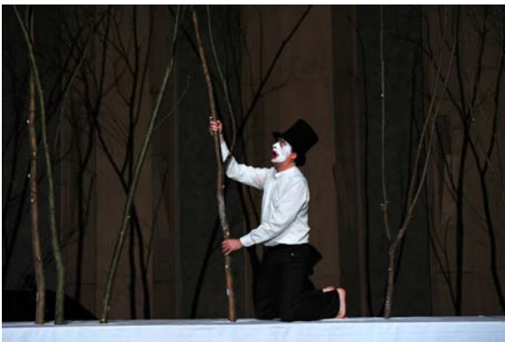
Fig. 6 Michael Borremans, WInterreise , 2014, stage performance

Borremans overcame as a genius. The visual imagery (and iconography) he created for WInterreise had its première in 2014, a production of the Muziektheater Transparant and Ensemble Intercontemporain for the Klara Festival, Bozar, Cité de la musique, in Belgium. The Belgian Artist presented a powerful WInterreise , creating scenery and wardrobe and set it on stage as though he was making an overwhelming installation, a grand and crucial Umwelt . Borremans' production was so huge and moving that the public would like to jump into transcendence and ensure a lap over human existence. When looking at the video registration of the Première , we immediately notice the intensity of two presences – the singer and the pianist are absolute. They come with perfection their technique and conduct us – as viewers and spectators – towards a realm where chronology as no meaning and ensures all the possible contents of inner-consciousness.