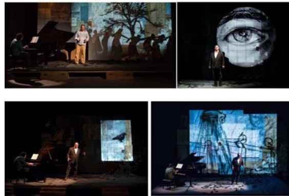
Fig. 7 William Kentridge, WInterreise , 2015, stage performance

characteristics, which established both Wilhelm Müller's text - narrated along the 24 poems, and the iconography, illustration held according the subject. William Kentridge conceived 24 ink drawings and collages to which gave movement, projected in a huge screen as 24 stop-action films. The technical procedure was similar to the ones the Artist usually applies in his video-installations and films. The Première happened at the Salzburg Festival in July 2014, with the baritone Matthias Goerne and the pianist Markus Hinterhäuser as leading figures.