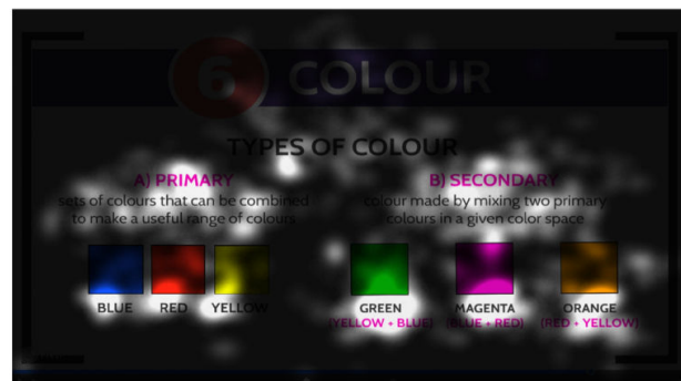
Fig. 3 Focus map of a participant's gaze pattern