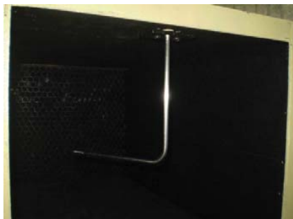
Fig. 3 Pitot tube

After the diffuser, the drainage suffers an acceleration, due to the presence of a contraction in which the drainage suffers a pressure loss, that is, turns into kinetic energy (speed) that goes to the rehearsal section. The whole construction of the structures of the tunnel (diffuser, contraction, rehearsal section), they were accomplished by techniques used by [17]. Parts as: The box of harmonization of the drainage; the cooker hood to retain the coming vibrations of the motor and the helix of the motor for generation of the wind, technical were accomplished used at the Laboratory of Aerodynamics. Figs. 3 and 4 show a view of the Pitot tube, the Fig. 5 presents the centrifugal fan used in aerodynamic tunnel.