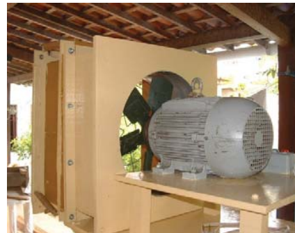
Fig. 5 Centrifugal fan