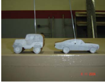
Fig. 8 Models 3 and 4