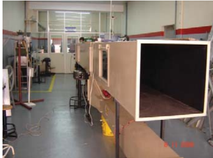
Fig. 1 Aerodynamic Air Tunnel

thickness of the wall of the cells between 0,5 and 2,0mm. The beehive was built starting from tubes of PVC that were cut with 200mm of length each one. Those parts were mounted and agglutinated, forming 625 cells of square section 50x50mm. In Fig. 2, the final assembly of the beehive.