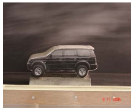
Fig. 7 Model 2