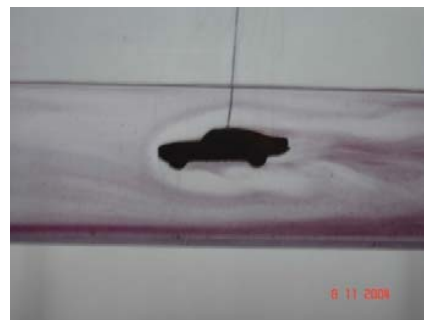
Fig. 12 Text Model 4

In a streetcar, the sustentation should not harm the aerodynamic efficiency, for they are obtained larger acting and smaller consumption.