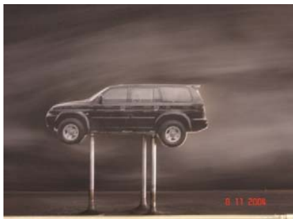
Fig. 10 Text Model 2

In the water tunnel, it is observed that the model 4 (Fig. 11) has an upper aerodynamic to model 3 (Fig. 12) due to formation of less turbulence and production of least resistance. In the same way that the model 4 in relation to the model 3, this "better aerodynamics" of the model 4 is due to the fact of possessing a closer form of a "wing" and a smaller front area.