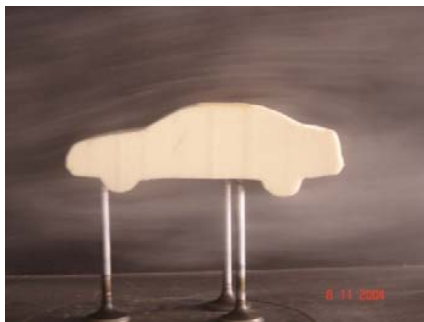
Fig. 9 Text Model 1

In the wind tunnel, it was possible to notice that the drainage of air through the model 1 (Fig. 9) finds smaller resistance than the model 2 (Fig. 10). This happens due to form of the model 1 to be aerodynamic, produced minor I drag and turbulence formation.