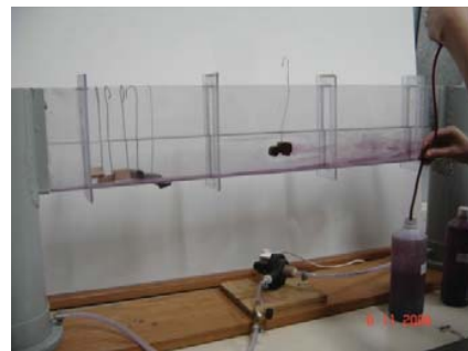
Fig. 6 Water of tunnel