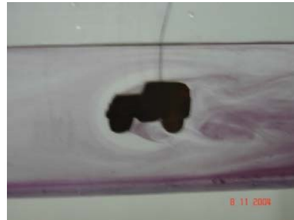
Fig. 11 Text Model 3

In the automobile branch, the aerodynamics is factor of highest importance that will contemplate later in the acting of the automobile, as economy or stability.