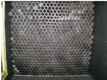
Fig. 2 Box of harmonization of the type beehive

After the diffuser, the drainage suffers an acceleration, due to the presence of a contraction in which the drainage suffers a pressure loss, that is, turns into kinetic energy (speed) that goes to the rehearsal section. The whole construction of the structures of the tunnel (diffuser, contraction, rehearsal section), they were accomplished by techniques used by [17]. Parts as: The box of harmonization of the drainage; the cooker hood to retain the coming vibrations of the motor and the helix of the motor for generation of the wind, technical were accomplished used at the Laboratory of Aerodynamics. Figs. 3 and 4 show a view of the Pitot tube, the Fig. 5 presents the centrifugal fan used in aerodynamic tunnel.