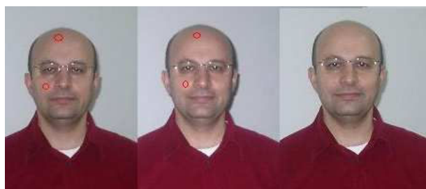
Fig. 3. A video sequence with changing lighting condition.

compared to their correspondences in the last frame in the sequence given in frame 3. Four small regions have been