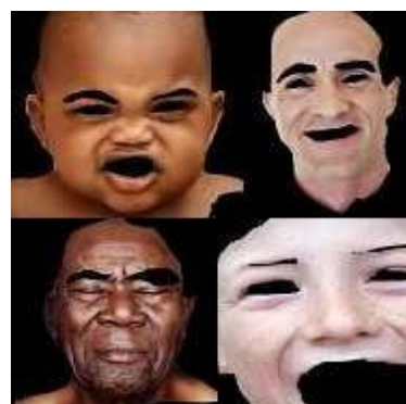
Fig. 2. Manually segmented training data.

compared to their correspondences in the last frame in the sequence given in frame 3. Four small regions have been