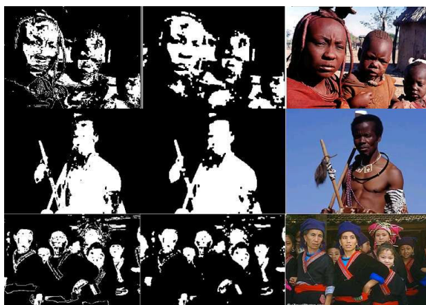
Fig. 4. Skin color regions segmented using non-adaptive GMM (left), proposed method (middle), and the original image (right).

An adaptive skin color segmentation algorithm based on Gaussian Mixture Model (GMM) has been proposed which can adapt the model parameters to cope with the changing imaging conditions such as lighting and noise. The algorithm considers the higher level a-priori knowledge of spatial and temporal relationship between the pixels in a video sequence. The experimental results show the superiority of the proposed algorithm compared to non-adaptive parametric models. Further improvement can be achieved by incorporating application specific information such as human motion models or face-hand detectors. The proposed method may also be used in surveillance systems and motion detectors.