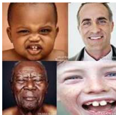
Fig. 1. Samples from training data.

The initial training of the Gaussian components is carried out using a data set of skin color pixels that includes 127,352,563 pixels. The training images have cautiously been selected to cover almost all ethnic groups and imaging conditions. The training images were manually segmented before parameter estimation. Figure 1 shows a subset of the training images and Figure 2 shows them after being manually segmented. The color space used is YCbCr. To reduce the effect of illumination, Y channel has not been considered through out the segmentation process. We start the initial EM stage with five components. This assumption is based on our intuitive classification of the skin samples using their appearance color. The second stage of EM algorithm tries to optimize the number of components. According to the results of this stage, the optimum number of components is seven. The adaptive algorithm uses the results of this stage for segmentation. Figure 3 shows a sequence of frames indicating changes in lighting condition. Some pixels from the first frame have been