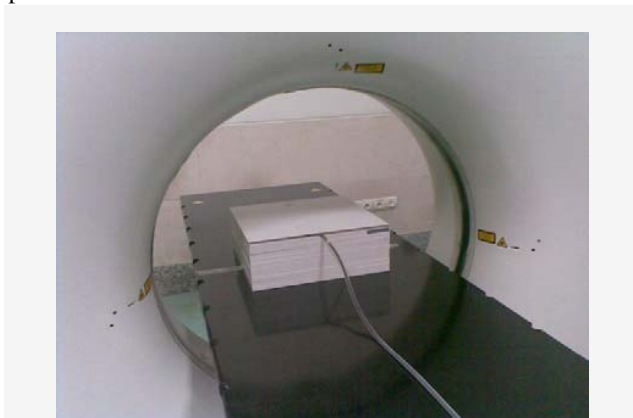
Fig. 1 phantom placed in CT scan device

The transmission factor is the ratio of the doses (at the depth and distance from the source corresponding to the reference condition) with and without the cerrobend in position.