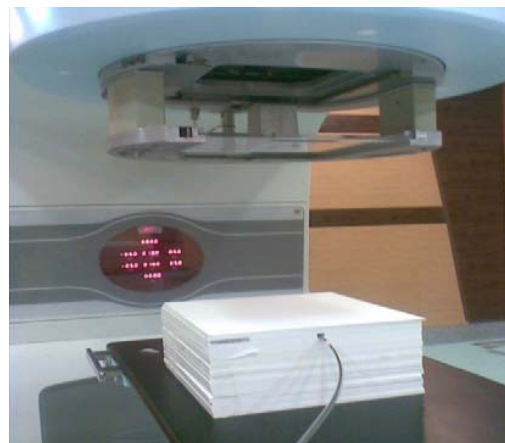
Fig. 2 placement of Tissue equivalent phantom on a flat linear accelerator