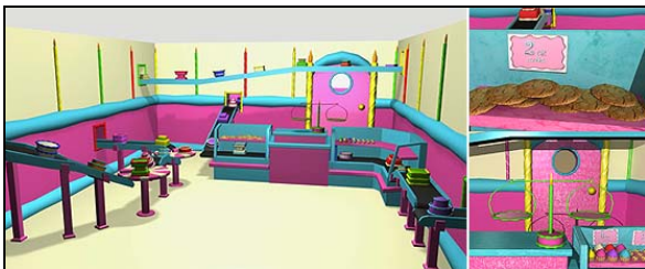
Fig. 1 The virtual Bakery

The virtual world is represented in a visual style with which the target users of the application (children age 5-10) are familiar: it is cartoon-like. Disney's Toon-town [11] was used as a visual reference for the design of characters and environments. Key design features of the environments include basic geometric shapes with soft and round edges, vibrant and varied colors, and a bright lighting setup with limited shading and without shadows. The choice of the color and lighting schemes was based on research studies on the impact of color and light on learning [12] [13], and on the association between colors and children's emotions [14]. One study shows that de-saturated colors have a negative impact on stimulation while highly saturated colors increase alpha waves in the brain which are directly linked to awareness. Another study reports that younger children (5-years-old to 6 ½-years-old) are especially attracted to vibrant and warm colors and most positive emotional responses are associated with very bright colors. Research on the relationship between light and learning suggests that a bright lighting setup, with the presence of daylight, is associated with improved students' performance [15]. The color palette and lighting scheme of our virtual environments represented in Figs. 1 and 2, show adherence to the above mentioned research findings.