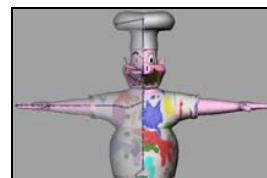
Fig. 4 Bakery character. Skeletal rig, left; rendered image, right