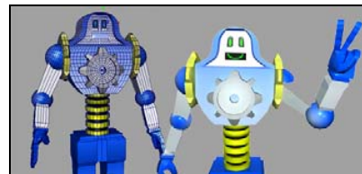
Fig. 3 Clock store character. Polygonal mesh, left; rendered image, right