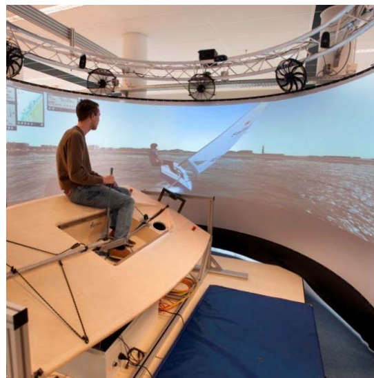
Fig. 9 InnoSportLab’s Yacht Simulator

InnoSportLab’s virtual reality software tracks a vast range of physical responses to such things as rudder pressure, trimming actions and sheet tensions. Performance data can be read in real time. The simulator also stores complete race records that can be re-run later. The sail simulator is a product of Stentec Software BV and Delft University of Technology. The center runs several other hi-tech research projects in service of Dutch