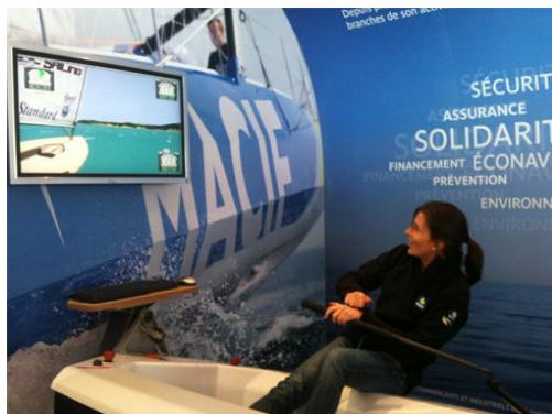
Fig. 2 VS-C1's Yacht Simulator