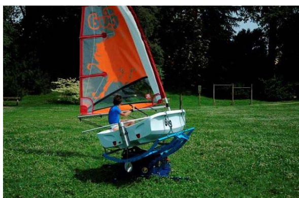
Fig. 6 Sailing Maker’s Yacht Simulator

The stable, solid, safe cradle ensures great adaptability for housing all classic sailboats: Optimist, Laser, RS, Equipe etc. Easily and quickly assembled without the need for special tools and entirely realised in painted steel to prevent corrosion from water and humidity over time. Four castor wheels make SAILING MAKER particularly safe and easy to manoeuvre, even with a full load. An industrial, low absorption fan positioned in front of the cradle modulates the right amount of air to create the best conditions for practising manoeuvres before attempting to do so on the water. Fig. 6 shows sailing maker’s yacht simulator [8].