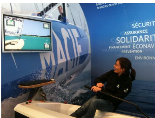
Fig. 2 VS-C1's Yacht Simulator