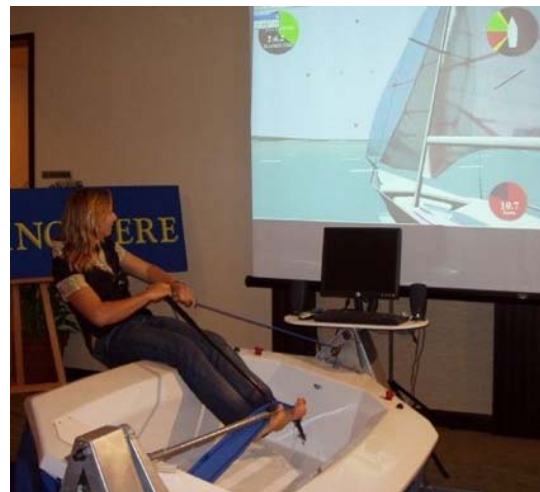
Fig. 4 Vsail's Yacht Simulator