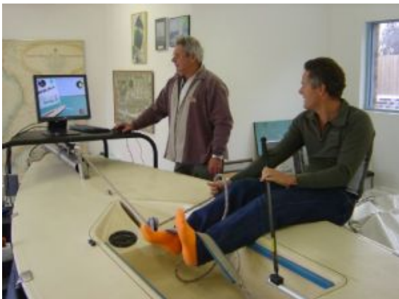
Fig. 11 Victoria's Yacht Simulator

Yachting Victoria's strategic objective for coaching is to increase the success of competitive sailors by ensuring the availability of coaching services for sailors wanting to improve their performance, skills and results by the, Development and support of qualified coaches, Development and support of coaching programs at clubs and recognized classes, Support coaching programs for those top competitive sailors with potential to make the Australian Sailing Team and Australian Sailing Development Squad, Provide well understood and excellent pathways for skills development for competitive sailors and coaches.