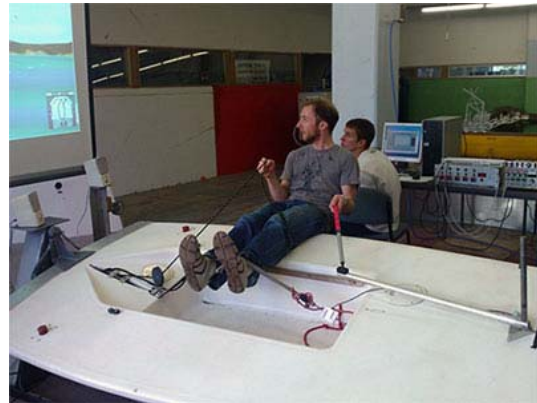
Fig. 3 Australia's Yacht Simulator