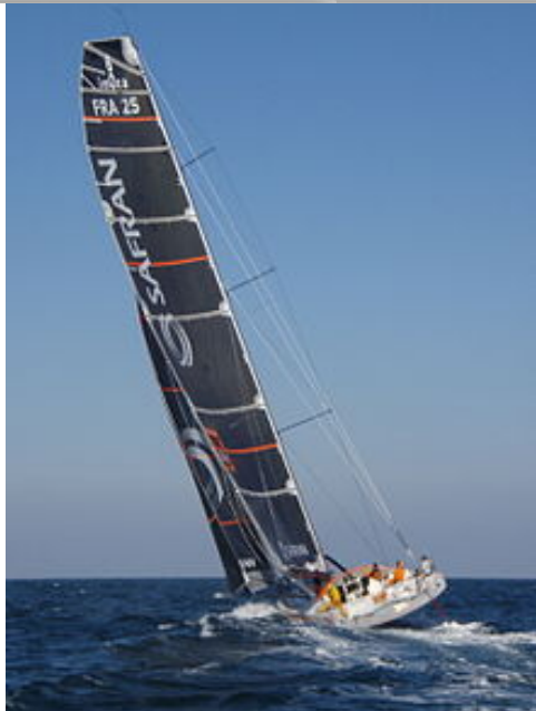
Fig. 1 Sailing Yacht