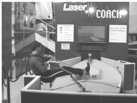
Fig. 7 Laser Coach’s Yacht Simulator

The user receives feedback from the visual representation of where the dinghy is relative to the wind and course, as well as feedback from the simulator in the form of rudder forces, mainsheet tension, heel moment and angle. It is then up to the user to balance these forces and moments.