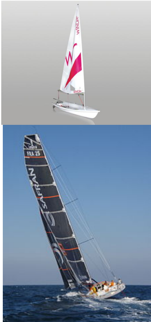
Fig. 1 Sailing Yacht

concentrations will also be measured throughout the task as additional indicators of the energy cost of the activity. These methods will provide measurements of the energy input. Fig. 3 shows Australia's yacht simulator [6].