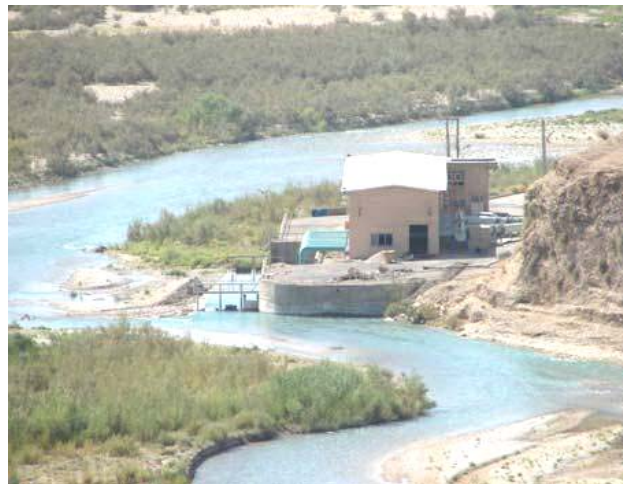
Fig. 2 Boneh Basht pumping station

Considering the location of the suction pools of Kheir Abbad River and the condition of river sediments, sunken sheets with blades must be selected to correct the trend of sediment transfer. Epis not only create a suitable sedimentation pattern but also do not have abnormal effects on the natural behavior of the river and, therefore, do not have unsatisfactory effects on the river environment. By creating secondary spin, change the amount and direction of cut tension of the river bed and result in the collapse of the river bed and creation of platforms. The whirling current is created on the two sides of the sheet due to the development of vertical pressure gradient. The function of multiple and multi-layered (as a collection) sheets and with a defined pattern will have a suitable efficiency.