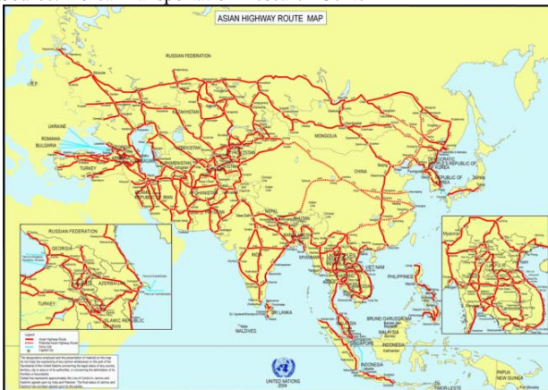
Fig. 2 Asian highway route map