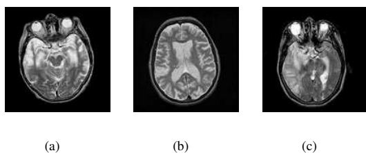
Fig. 3. (a) Pick's Disease (b) Huntington Chorea (c) Cerebrovascular Fatal Stroke; Courtesy to:[25]

the objective to estimate the exact affine parameters, this paper suggests the use of various robust functions that gradually acquaints nonconvexity as the multiresolution pyramid reaches its finer level of resolution. This new proposal considerably improves the power of parameter estimation in all kind of images and hence one can say that the proposed approach achieved the worthy level of applicability.