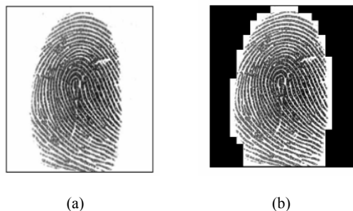
Fig. 2 Foreground segmentation (a) Original image (b) Segmented image

where VAR(I) is the variance for block I , I(i, j) is the grey-level value at pixel (i, j) , and M(I) is the mean grey-level value for the block I .