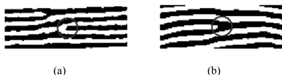
Fig. 1 Two types of minutiae (a) Ridge Ending and (b) Ridge Bifurcations