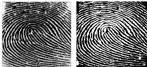
Fig. 12 Ridge smoothing (a) Original Image (b) Image after ridge segmentation and smoothing

Once the ridges are located, directional smoothing is applied to smooth the ridges as shown in Fig.12. The same masks used for ridge segmentation can be used for directional smoothing. Here for each and every block, a mask gets selected according to the dominant direction of the block. Each pixel on every line is checked. If the count of '1's is more than 25% of the total number of pixels in the line, then the ridge point is retained by making all the pixel values of the line 1s. If the count of 1's is less than 25% of the total number of pixels in the line, all the pixel values are made 0s.