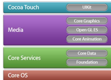
Fig. 2 iOS Framework

The main approach of the iOS Framework is to give an opportunity to clearly and easily create iOS & Android apps with HTML, CSS, and JavaScript. It offers ways of possible solutions somehow. However, it is not compatible with all platforms. It is focused merely on iOS and Google Material design that brings the best experience and easy to use. It is shown in Fig. 2.