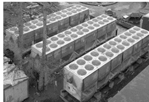
Fig. 1 Chillers under study

The proposed system is the mechanical system of a 540-bed hospital in Mashhad city with three air-cooled chiller as shown in Fig. 1.