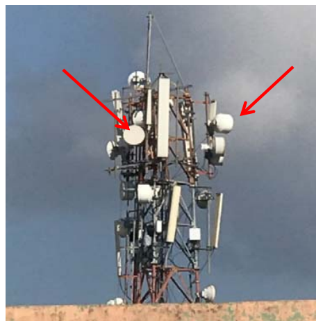
Fig. 1 A communication mast in Hyderabad, India; the microwave drum-like antennas, denoted by the arrows, were originally designed for communication needs and can constitute a built-in sensor network for environmental monitoring

Commercial MWLs operate at frequencies of tens of GHz and close to ground level, typically at elevations of tens of meters above the surface. These systems provide measurements of the Received Signal Level (RSL) at typically high temporal resolution (for example, every 15 minutes). The cellular providers typically store this standard data for quality of assurance needs. Weather conditions affect the signal strength of the wireless network and it can therefore be used as an environmental monitoring facility.