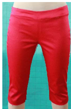
Fig. 2 One of the photos with a participant in a static status

The data were acquired in following steps: 1) 15 pairs of pants were worn by participants in a static status. The participants are in Chinese standard size of 160/68A; the criteria for recruiting audience includes that they must be Chinese residents and they have experience related to fashion design, such as enrolling in a fashion design program, runway models, and fashion designer. 2) The experimenter took photos for each pants worn by participants when they are in the static status (an example of photos in Fig. 2). In the study, 5 people were recruited as participants and 11 people were recruited as audience. It is noted that the number of participants and audience meet requirement of human factorial experiment that 5 to 12 participants are a sensible baseline range [18].