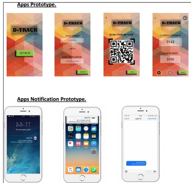
Fig. 2 D- Track

initiated towards the physical que system and integrated with the mobile application for better approach in que system.