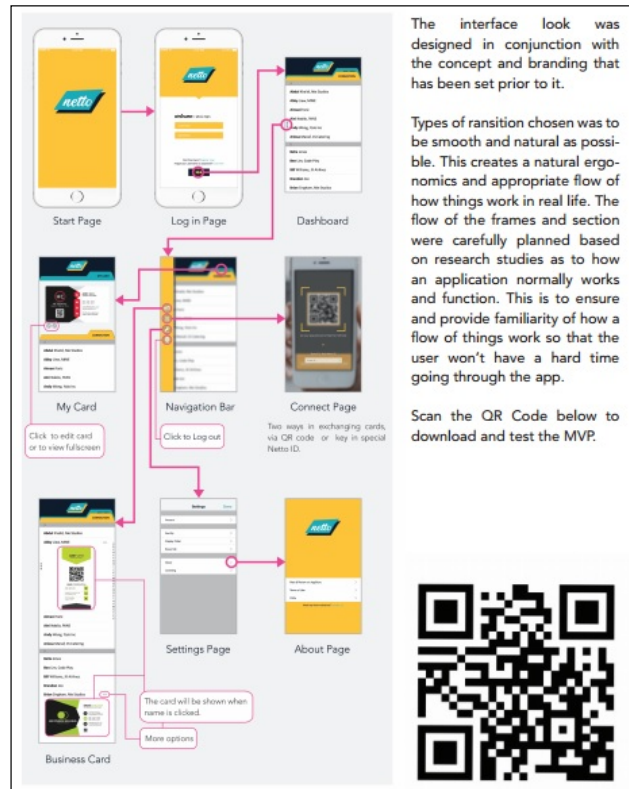
Fig. 5 Netto

example, there is also the poster session for showing their idea for the implantation of the prototype by Faculty of Creative Multimedia. Meanwhile Faculty of Management has their ability on showing the skill for oral presentation while participants from Faculty of Engineering and Faculty of Computing Information also showed their ability in designing the technology for the product. This also has the impact of sharing their knowledge in different study fields.