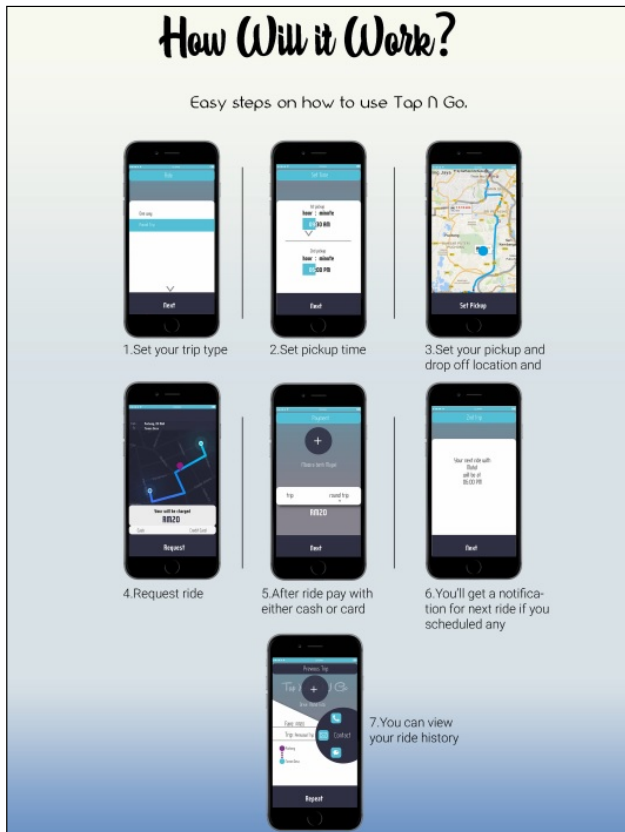
Fig. 4 Tap n Go