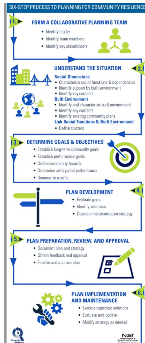
Fig. 4 NIST Community Resilience Planning Guide

parameter part of a much bigger picture.