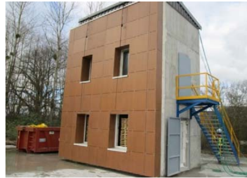
Fig. 1 LEPİR II test rig

The main test for fire spread on facades in France is called LEPİR II. This test is made on a test rig build specifically for façade tests (see Fig. 1) [8]. This test is particular because it includes four openings, is clearly representing two stories of a building, and the rig is closed from all sides. This is a full-scale test and one of the “most complete of all current façade fire spread test methods” [9].