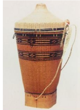
Fig. 8 A rattan basket for keeping clothes of the Bahnar, Gia Lai province, Vietnam [4]

Comparing the color schemes of the Bahnar, Jrai and M'ngong people through some samples of brocade (Figs. 7, 9, 10), it was easy to see that the number of colors used was increasing, however, the richness of shape and size was decreasing.