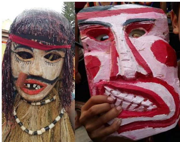
Fig. 11 Bahnar masks, K'Bang district, Gia Lai Province, Vietnam; Photo: Nguyen Thi Kim Van

The preference for red and choosing it for the main color in decorative patterns could be seen in a series of other products in the Bahnar's living space until nowadays. One explanation for this was confirmed by some Bahnar people when we interviewed them at field trips, that they used to have products made at festivals, such as masks (Fig. 11), with red from the blood of the sacrificed animals and the black of charcoal. Later, although a lot of modern materials are imported from the outside, such as oil paints, they still chose the red and black to paint on the mask and many other things in the festivals.