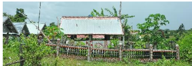
Fig. 3 A tomb-house in Kong Chro district, Gia Lai province, Vietnam; Photo: Nguyen Viet Tan (2018)

Similar to the other ethnic groups in the Central Highlands, the Bahnar had three main architectural types, including dwelling-houses, a community house (Roong), and tomb-houses. The dwelling-houses of other ethnic groups were rarely decorated with motifs except for some wooden sculptures on the stairs and on the main beam (as in the case of the double beams separated the long house of the Rahde into 2 parts: Ôk and Gah). Particularly for the Bahnar, they decorated all of those architectures with decorative patterns, usually on knitted bamboo. The colors of those decorative patterns on architectures included only red on a white background or a light grey background of a non-dyed bamboo material (Figs.