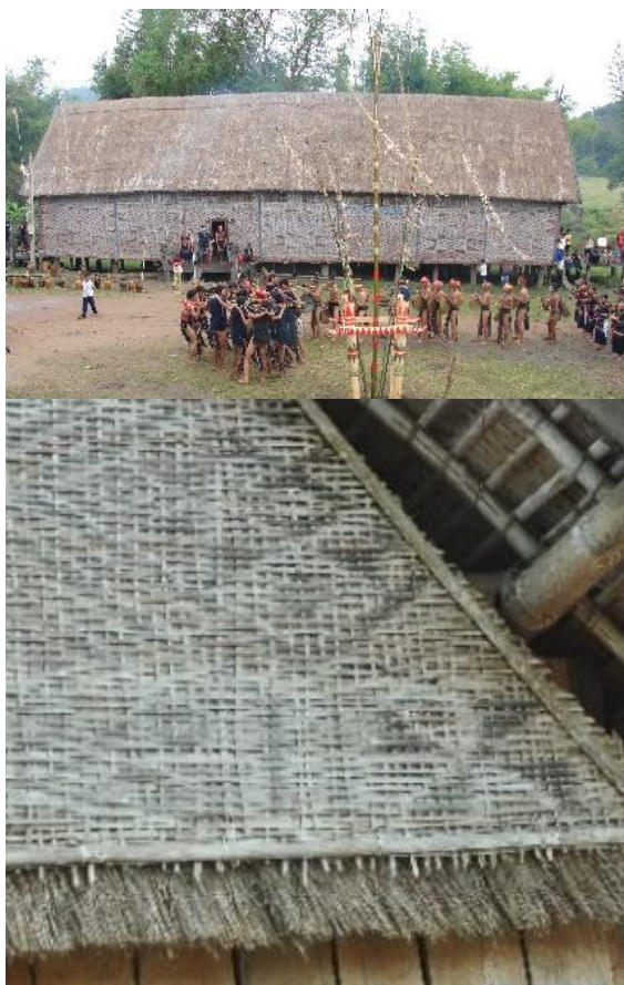
Fig. 4 A community house in Kong Chro district, Gia Lai province, Vietnam; Photo: Nguyen Viet Tan (2018)

As we could see in the three examples of architectural decoration in Figs. 2-4, the star/sun was the main motif shown in the center, surrounded by triangular stripes which were inspired by the shape of some types of leaves that Tu Chi sorted in the fourth group. Triangular and straight line patterns were most commonly used in all three types of architecture. However, it could be clearly seen that the level of decorative details increased from dwelling-houses to community houses and much more in the tomb-houses. In addition to the walls, the community houses were also decorated on top of the roof, stairs, front yard, and the frames of the doors. Decoration in the tomb-houses included the surrounding statues and other kinds of sculpture, there are mainly vegetable motifs, animal horns and geometric motifs. They were also added by colorful drawings after carving (Fig. 5).