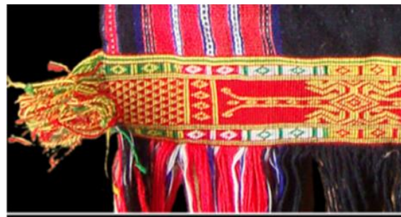
Fig. 9 The color of Jrai ethnic group, Gia Lai province (North Central Highlands of Vietnam); Photo: Thanh Nga & Huyen Ly

Comparing the color schemes of the Bahnar, Jrai and M'ngong people through some samples of brocade (Figs. 7, 9, 10), it was easy to see that the number of colors used was increasing, however, the richness of shape and size was decreasing.