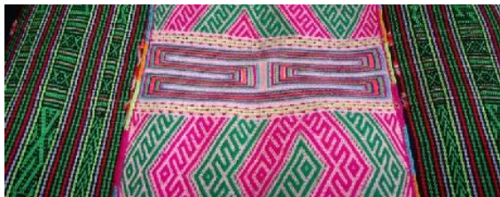
Fig. 10 The color of M'ong ethnic group, Dak Nong province (South Central Highlands of Vietnam); Photo: Nguyen Thi Kim Van

pink, and more colors in other examples. M'ong people could be said to have a variety of colors in their brocade to set up a lot of colorful combinations, so they might have selected the same shape and size in decorative patterns to avoid messing up the work. In decorative patterns of M'ong's handicrafts, the main part and the side stripes were distinguished by main colors using in each part (pink and green), but their shape, size and details were set up similarly.