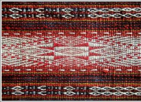
Fig. 7 The Bahnar's decorative patterns in brocade, Gia Lai Province, Vietnam

B. The Difference in Color Schemes between the Bahnar and Other Groups of People (Case Study: The Jrai and the M'ngong)