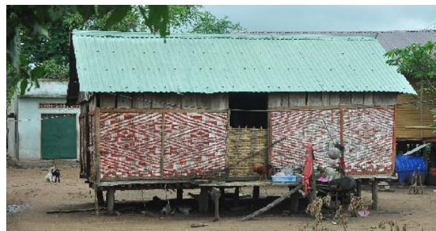
Fig. 2 A dwelling-house in Kong Chro district, Gia Lai province, Vietnam; Photo: Nguyen Viet Tan (2018)

A weakness of the valuable report of Tu Chi was that the drawings were printed in black without any notes about colors, and the printing quality was very low due to the limitation of technical ability in Vietnam at that time. There were also a few colored drawings for illustration but they might have been inaccurate with reality because they looked very different from the photos in this book. Based on the list of 26 black-printed patterns in the book of Tu Chi, we made a review of the decorative patterns in the living space of the Bahnar in Kong Chro recently (as a case study) in order to confirm the way that the Bahnar used colors in their decorative patterns.