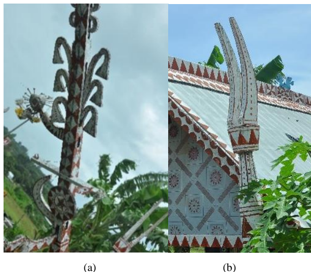
Fig. 5 (a) The shape of the vegetable Don (b) Buffalo horns, Ya Ma Commune, Kong Chro district, Gia Lai Province, Vietnam

As mentioned in the overview, the geometry shapes in the Bahnar's decorative patterns might have been the consequence of knitting techniques. But later, it might have led them to choose geometry shapes as favorite options even in sculpture or painting although they are no longer dependent on knitting techniques (Fig. 6).