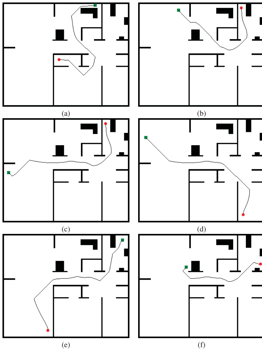
Fig. 3 The generated paths from several different start and goal positions

r for the MAM method. Hence, based on the finding shown in Table I (i.e. the optimum value of r was closed to \omega ), the