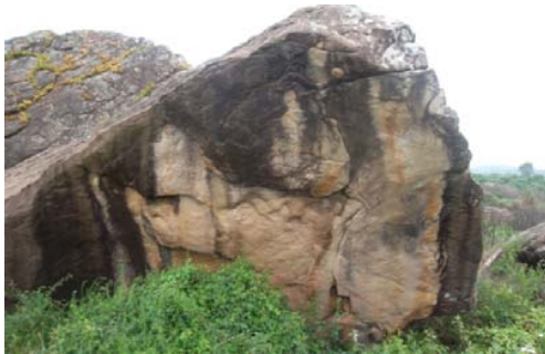
Fig. 5 Ifran I site