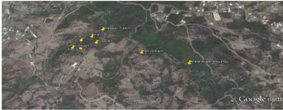
Fig. 4 Ifran sites