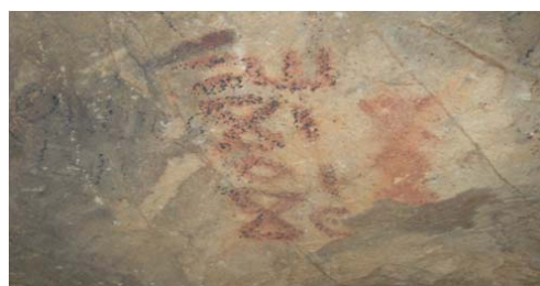
Fig. 21 Libyc characters