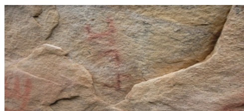
Fig. 15 Libyc characters