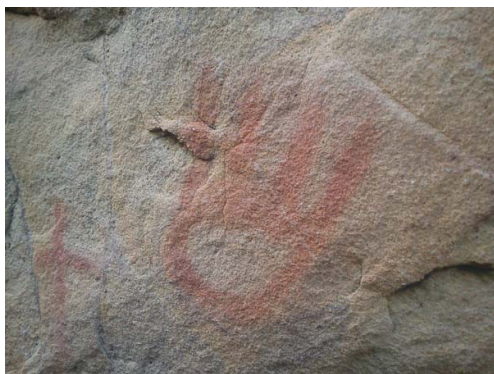
Fig. 16 Figurine