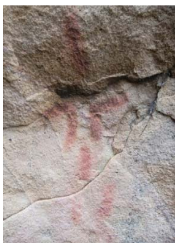
Fig. 12 Libyc characters