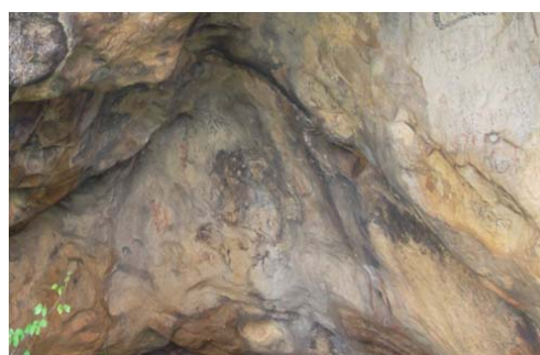
Fig. 20 Ifran II