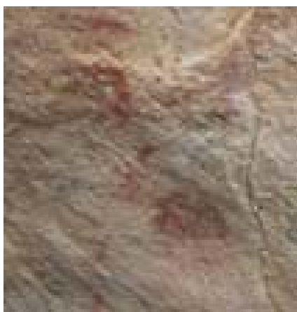
Fig. 17 Figurine