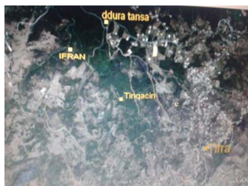
Fig. 3 Ifran sites