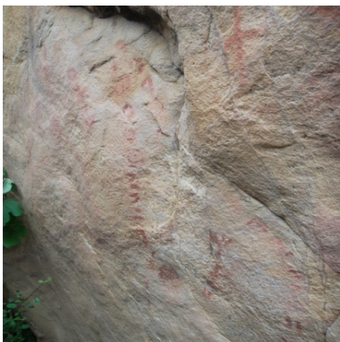
Fig. 7 Libyc characters