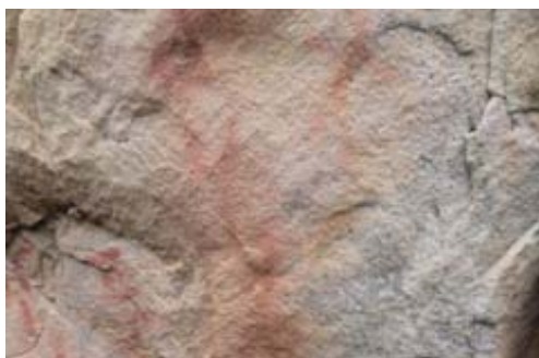
Fig. 18 Figurine