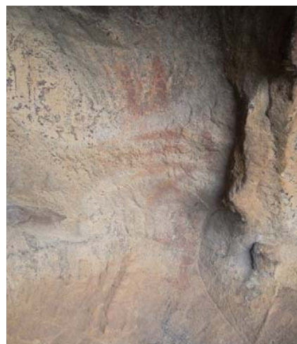
Fig. 22 Libyc characters

The set of characters of these two sites is about 91;