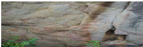
Fig. 6 Decorated wall with Libyc inscription