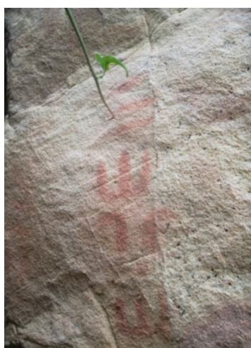
Fig. 11 Libyc characters