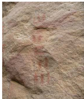
Fig. 13 Libyc characters