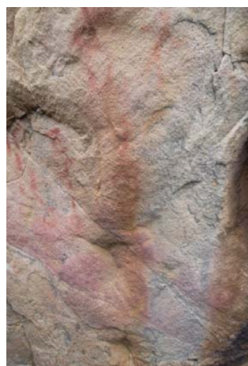
Fig. 14 Libyc characters