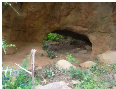
Fig. 19 Ifran II