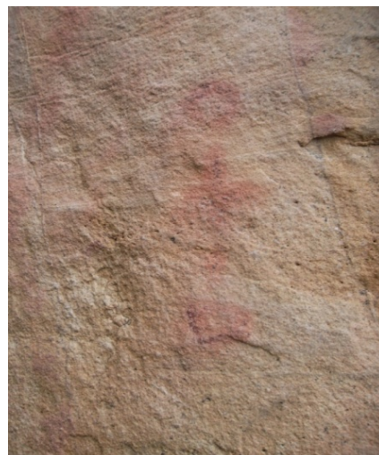
Fig. 9 Libyc characters