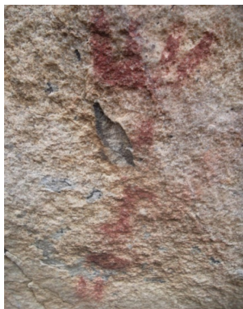
Fig. 10 Libyc characters