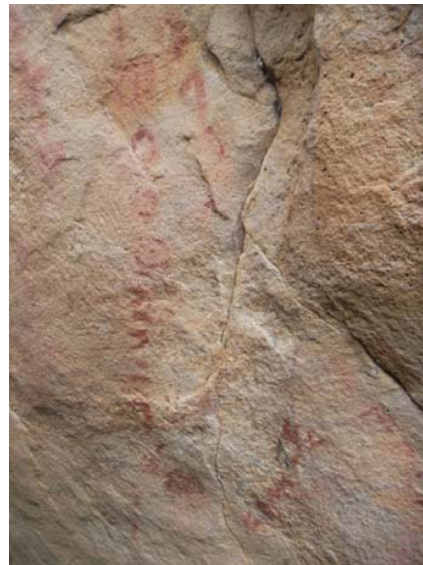
Fig. 8 Libyc characters