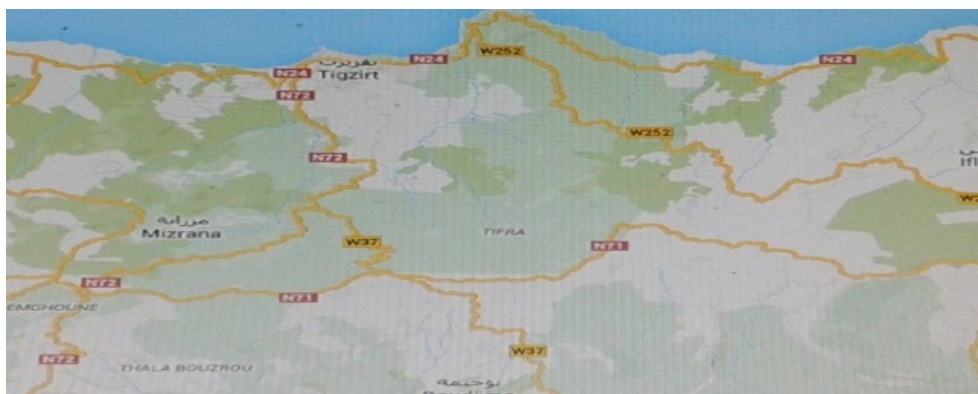
Fig. 1 Tifra region