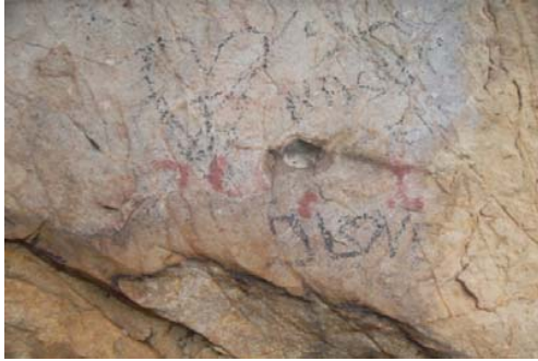
Fig. 23 Libyc characters