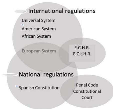
Fig. 1 Regulatory systems in the international and national scope and some control organisms

the African. Court of Strasbourg is one of the supervisory bodies of the European system [6].