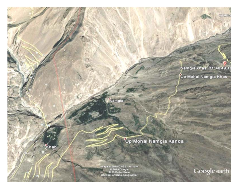
Fig. 2 Google Earth map of the Juniper inhabited area of Kinnaur