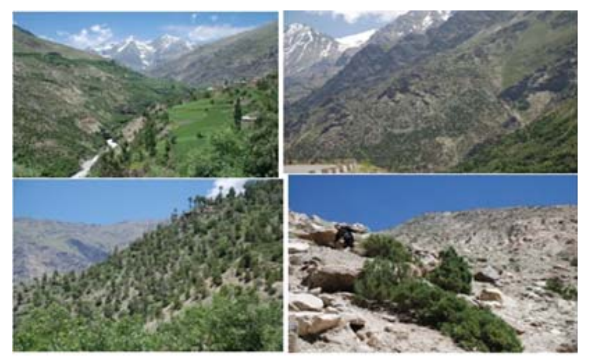
Fig. 3 Study sites of Juniper Forest at Kinnaur and Keylong