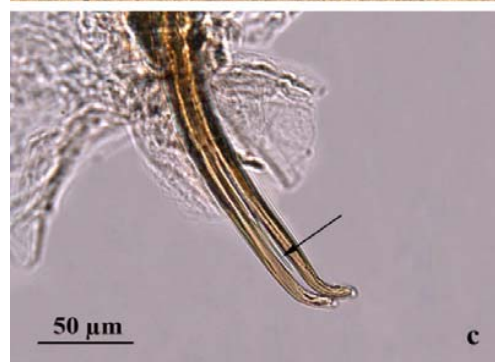
Fig. 1 Crenosoma petrowi found in the lungs from a stone marten from Bulgaria: a) Posterior end of the body. b) Spicules (1) and gubernaculum (2) under compression. c) Distal spicule ends. The arrow - spicule growth