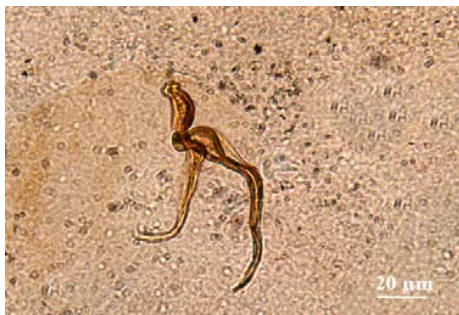
Fig. 3 Spicules of Sobolevinygylus petrowi found in the lungs from a stone marten from Bulgaria (under compression)