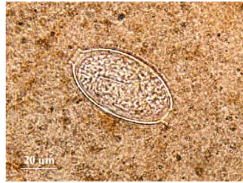
Fig. 4 An egg of Eucoleus aerophilus found in the lungs from a stone marten from Bulgaria (under compression)

C. petrowi has been established in Bulgaria [9], Italy [2], Spain [3] and former Czechoslovakia [4].