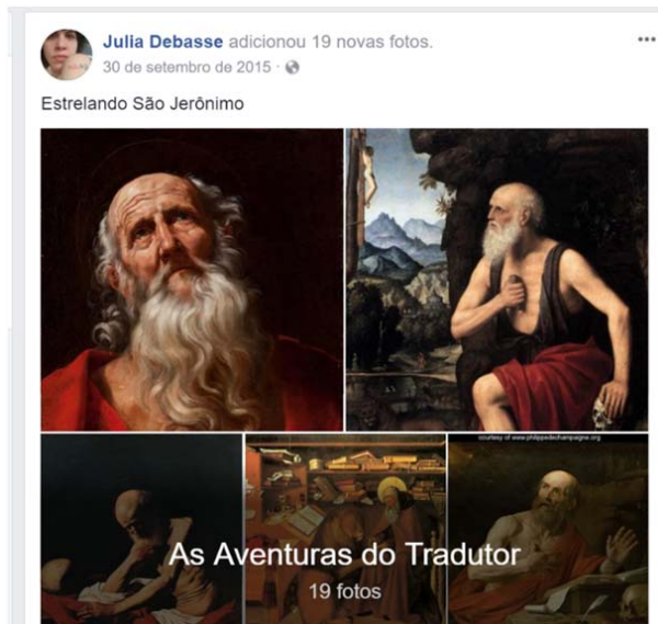
Fig. 2 Image collage and subtitles by Julia Debasse, available on the Group Translators / Interpreters

two groups, because, besides the fact of giving voice to translators, the groups also shine light over the profession's need for more appreciation. There is a "self-declaration" of being a translator and an attention to showing that the professionals do not only know how to translate, but also know how to discuss and defend their profession.