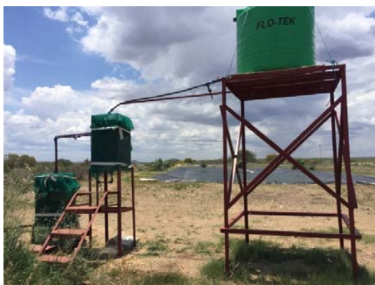
Fig. 1 Experimental setup for this study

The experimental rig consists of 1000 litres plastic tank placed on 2.5-meter stand. This tank feeds an acrylic roughing filter of cross sectional area 0.36 m 2 by 1.0 m depth acrylic on 1.5 m stand, which in turn feeds a slow sand filter of similar and same size on a 0.5 m stand (Fig. 1).