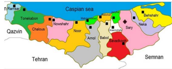
Fig. 2 Map of Mazandaran province of Iran

After solving the problem using \epsilon -constraint method, the Pareto front is achieved that the view of it is illustrated in Fig. 3 and Table IV. For this purpose, at first, we run the second objective function separately that the values F_2^{min}=349 and F_2^{max}=14938 are achieved. Also, we consider n=15 and \epsilon=0.000001 to make Pareto front.