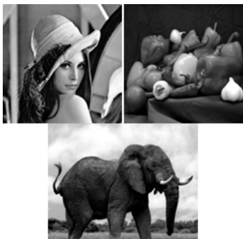
Fig. 6 Eroded images