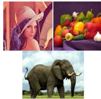
Fig. 2 Sample colored digital images