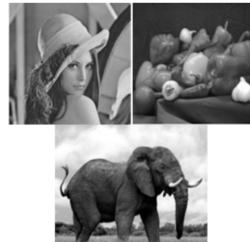
Fig. 3 Gray scale images of original ones