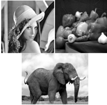
Fig. 5 Dilated images