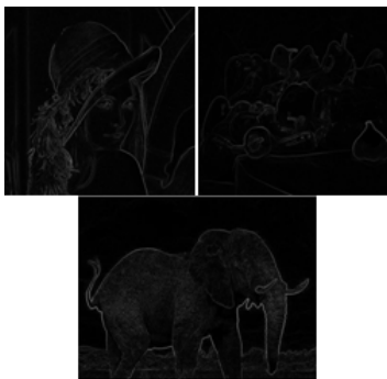
Fig. 7 Experimental results 1. (A - (A ⊖ B))