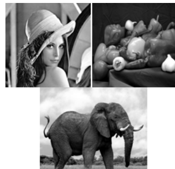
Fig. 4 Contrast enhanced images