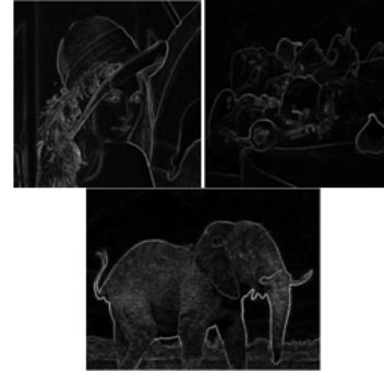
Fig. 9 Experimental results 3 ((A ⊕ B) - (A ⊖ B))