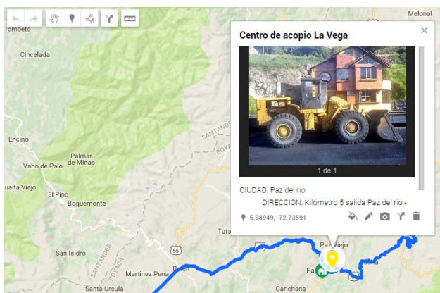
Fig. 2 Characterization of a collection center

The definition of candidates lots for location of collection centers was the result of a preliminary study by the directors, which established that these locations are found in the northern region of the department of Boyacá. The fixed cost of installation was calculated according to the value of commercial lease for square meter.