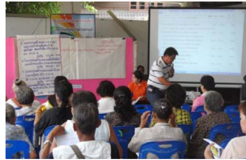
Fig. 3 Public meeting