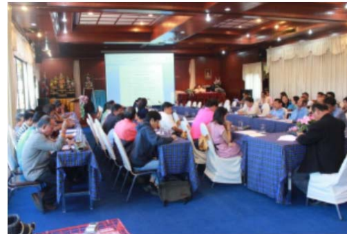
Fig. 4 Budget meeting