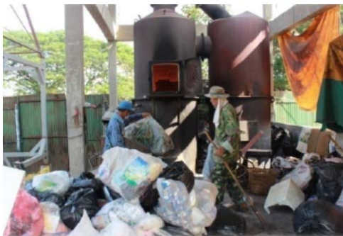
Fig. 2 The waste process

The correlation between the medial uses index and well-being is examined in the absence of controls. The analysis revealed a correlation of traditional media, interpersonal media, mass media, and new media. Meanwhile, the test of Hypothesis 2 is rejected that communication usage is related to happiness (using Pearson correlation r= 0.422 , sig 0.00 < 0.05 ). It is indicated that the relationship of communication type, which is interpersonal communication, has a relationship to the well-being of local people in the Donkeaw Community. The mass media have visited the area and reported on the success of community endeavours such as the ‘waste bank’ project and their award for transparency, public participation in community affairs and good governance. This is indicative of the openness and community spirit of the people in the area.