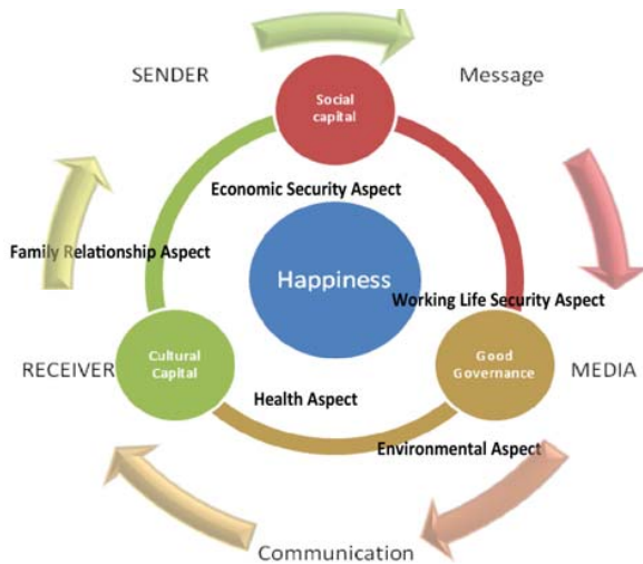
Fig. 7 System shows how communication affects people's well-being

group, cultures would soon disappear. Nonetheless, it can be said that from an economic viewpoint, culture and social relations are capital. If both are incorporated in a tourist activity, it would increase income for everyone. This may be good for smaller more isolated communities, as it would provide more economic advantages for local people, and therefore they would be less inclined to move away to search for work. The following illustration depicts this conclusion: