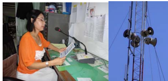
Fig. 6 Public Address System in Donkeaw Local Area

With an increase in communication within a group more is shared, structure develops, with the result that there is convergence. This principle also applies between groups. As contact between groups increase, they become more alike. If they lose contact, differences develop and become clearer. People often experience this personally when they lose touch with old friends and form new friendships; this process forms the base for cultural differences.