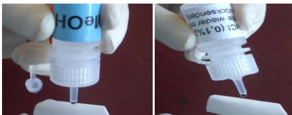
Fig. 2 Application of the fixatives (HCl and MeOH) to the paper filter (based on [12])