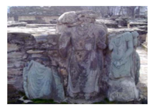
Fig. 7 Butkhara, a historic site next to Swat Museum (Pakistan) containing the unique ruins of Buddha, was partially damaged by shooting during the military operation [8]