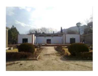
Fig. 9 Ongoing re-building and rehabilitation of Swat Museum by the Italian work [8]