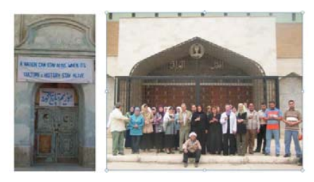
Fig. 3 The first step is close down [5]

The objects may be damaged in transit or as a result of improper storage in the new building, which can place the collection at threat of damage from humidity, pests, and etc. This highlights the importance of a solid contingency plan in which an evacuation is anticipated and planned for. Often, a library, archive or museum has enough space in another location to safely store their collection in case of emergency. In all cases, the mistake is usually made of transmitting materials to surroundings that do not meet the minimum preservation standards [5].