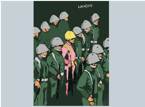
Fig. 3 Student Artwork – Reflection on Personalized Learning