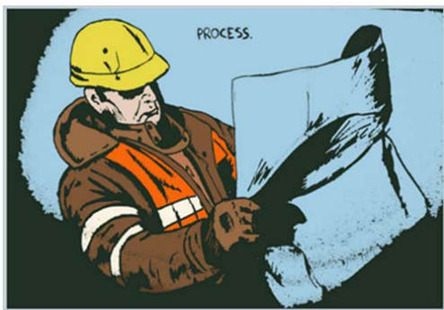
Fig. 4 Student Artwork – Reflection on Process in Learning