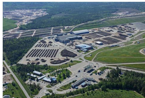
Fig. 1 Ämmässuo Waste Treatment Centre

Other Ekomo project includes the purification of sand used for sanding the roads and pavements. Purified sand can be reused, and the fine fraction separated from sand is utilized in top soil production from compost.