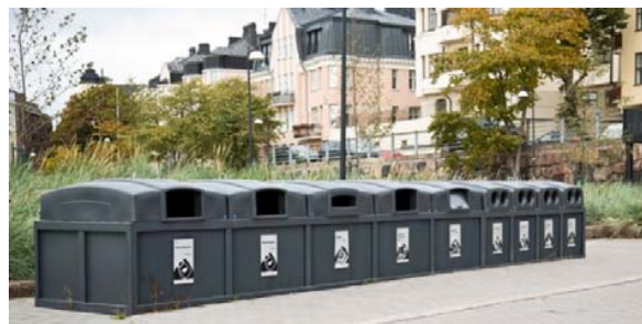
Fig. 3 Collection points

plastic packages as along with the new decree on packaging and packaging waste, the responsibility concerning the collection and recycling of domestic packaging waste is transferred to the producers [8]. The collection of plastic has been started at the collection points this year. Plastic collection has also been piloted at selected residential buildings from spring 2016 on.