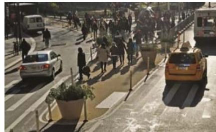
Fig. 5 Pedestrian safety island in New York [18]