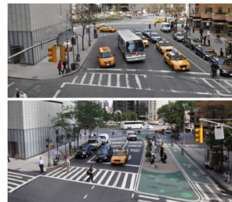
Fig. 2 Experimental phase of interventions creating new areas for pedestrians and cyclists on Broadway, New York [15]

The phase 0 actions, for example, accept their test condition nature and reinforce the relevance of being configured as an experimental stage on the human scale. This initiative refers to one of the main foundations of Tactical Urbanism, namely the Build-Measure-Learn approach and the Design Thinking cycle, whose concepts considered by Lydon and Garcia (2015) have been adapted to Urbanism and value the role of testing actions and the implementation of interactive and low-cost development processes [8]. Thus, these actions demonstrate an open field of possibilities that allows the pre-transformation analysis of space as a way of recognizing its real impacts, so that they can be designed for the long term if they are successful. It is in this phase of study that it is possible to evaluate the effects of such initiatives in real time avoiding expenses and future revisions [9]. Such experiences may indicate new demands or changes in the process as they are implemented. On the other hand, the temporary initiatives in the city can be configured as tactics whose primary characterizing factor is time, having a defined active period,