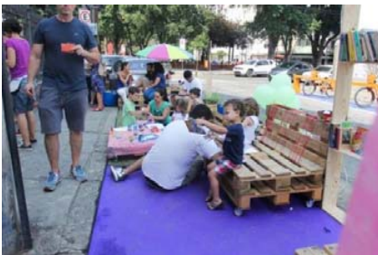
Fig. 12 Park(ing) Day, Rio de Janeiro, Brazil [22]

These sidewalk extensions promote the use of the public space in a democratic way and allow the community to build its own social space, even though temporarily. Some interventions can remain for hours, days, months or years, depending on the action. This is a movement which was initiated in San Francisco, USA, called Park(ing) Day, and aims to denunciate the big offer of space which are designed for cars and to boost city appropriation and social participation. It is important to highlight that, in the past few decades, some Brazilian cities such as São Paulo and Rio de