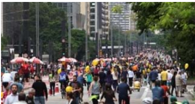
Fig. 8 Paulista Aberta, São Paulo, Brazil [21]