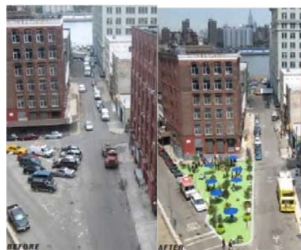
Fig. 10 Before and after the intervention at Pearl Street Plaza [11, p. 5]