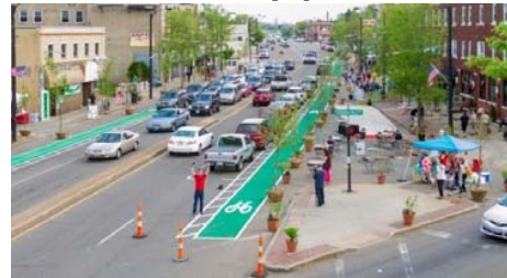
Fig. 4 Bike lanes in North Hill, Ohio, 2015 [17]