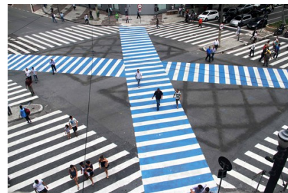
Fig. 6 Optimization of crossing lines proposed by São Paulo City Hall [19]