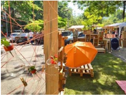
Fig. 11 Temporary parklet, Rio de Janeiro, Brazil [22]

Among the temporary initiatives which aim to encourage Active Transportation and claim for opportunity balance for pedestrians and motorized vehicles, there are assemblies called parklets. The replacement of street parking spaces for the installation of parklets subvert their original use and work as social gathering places and as invitations for people to use the road space which was designed originally for cars. According to the National Association of City Transportation Officials, parking spaces have the potential to host a big range of uses beyond what was originally designed to them and to boost urban vitality [9].