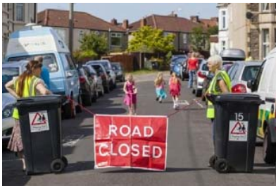
Fig. 7 Playing Out, Bristol, United Kingdom [20]

According to the Urban Street Design Guide, some types of temporary road closures can be highlighted, such as: play streets, pedestrian streets and open streets [9]. Play streets are often considered as extensions of schools or residential areas, delimiting spaces in the pathways for children's cultural and leisure activities. Open and pedestrian streets destine the use of the street for Active Transportation and offer invitations to stay in public space. Thus, two initiatives can be presented that boosted Active Transportation and which have become regular experiences, but have maintained their temporary character. As an example, we have the experience called Playing Out created in Bristol in England and Paulista Aberta in São Paulo, Brazil. In 2011, Bristol City Hall recognized the benefits of temporary road closures by some parents for child's recreational use. This initiative allowed the experience to happen regularly, encouraging other parents to do the same on other streets [8]. In Brazil, 2016, São Paulo City Council officially decreed the regularly temporary closure of Paulista Avenue , which since October 2015 has interrupted vehicular traffic and is open exclusively to the use of Active Transportation modes on Sundays. Both movements claim for safe and comfort spaces for leisure, walking and cycling, encourage the use of alternative transport and rethink the use of motor vehicles in the city.