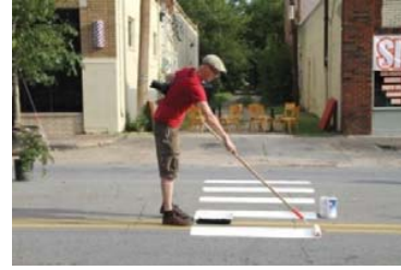
Fig. 3 Better Block Volunteer create new crossing lines in Oak Cliff, USA [16]

The Community-led movement "Build a Better Block" can be presented as an example of an initiative that since 2010 has proposed balancing opportunities among pedestrians and cyclists and motorized vehicles in neighborhoods of North American cities by creating more pleasant and safe areas for walking and cycling, strengthening the notion of community and neighborhood, and encouraging social engagement in urban decisions.