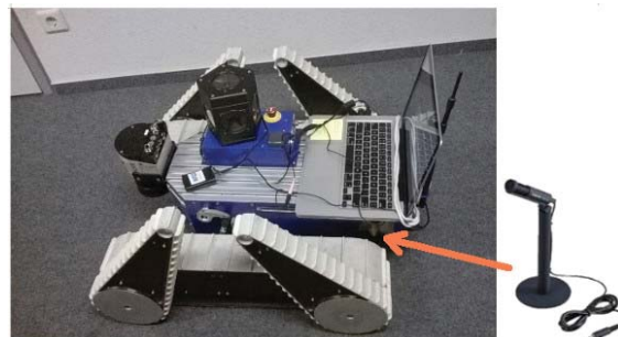
Fig. 1 Microphone Setup on the Robot

For the sound recording, we mounted a laptop onto the robot, equipped it with a small USB sound card (a Sennheiser USB adapter) and used an omnidirectional electret capacitor microphone (Elecom table microphone), which was placed next to the left rear motor and relatively close to the ground, as shown in Fig. 1. The recording was done with standard Linux software (audacity). All audio was recorded in 16 bit mono pulse-code modulation (PCM) with a sampling rate of 11025Hz.