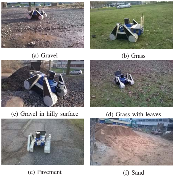
Fig. 2 Examples of various environments for the four outdoor terrain types

The recordings for the sand class had to be stopped prematurely because the sand entered between the belt of the main track and the driving wheel and dislocated the belt. Therefore, the amount of data available for the sand class is much lower than for the other terrain types. For all types except sand, we recorded around 24 minutes of audio, for sand, only a bit more than two minutes.