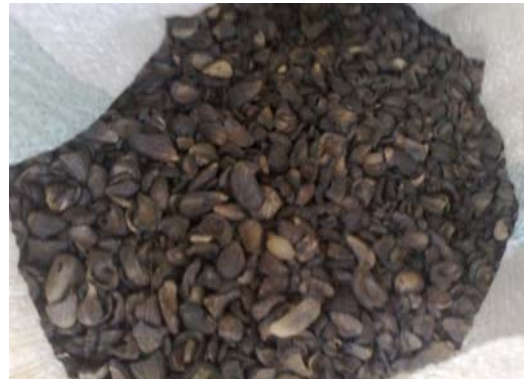
(a) PKS large aggregates

The PKS large aggregate shown in Fig. 1 (a) was obtained from the waste yard of a local palm oil producing company in Ibadan in the southwestern region of Nigeria. The sizes of the PKS large aggregates range from 5mm to 15mm. The PKS large aggregate was thoroughly washed to remove earthen impurities and dried. The sun dried PKS large aggregate was crushed to obtain PKS fine aggregate shown in Fig. 1 (b). Sieve analysis was conducted to determine the gradation (particle size distribution) of the PKS fine aggregate. The bulk densities and the water absorptions of the PKS fine aggregate and that of typical normal weight river sand were determined.