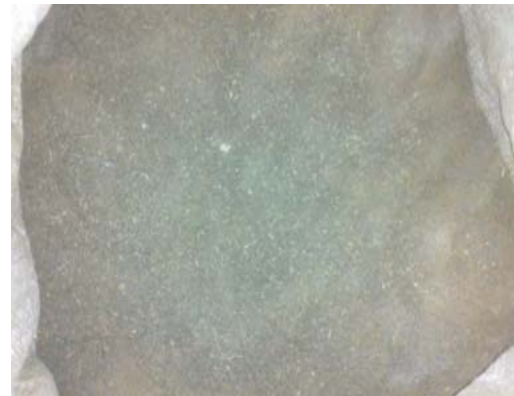
(b) Crushed PKS fine aggregate