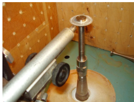
Fig. 1 Graphic image experiment of plate

It is obvious that (1) can be replaced by two equations of the second order according to the method of factorization