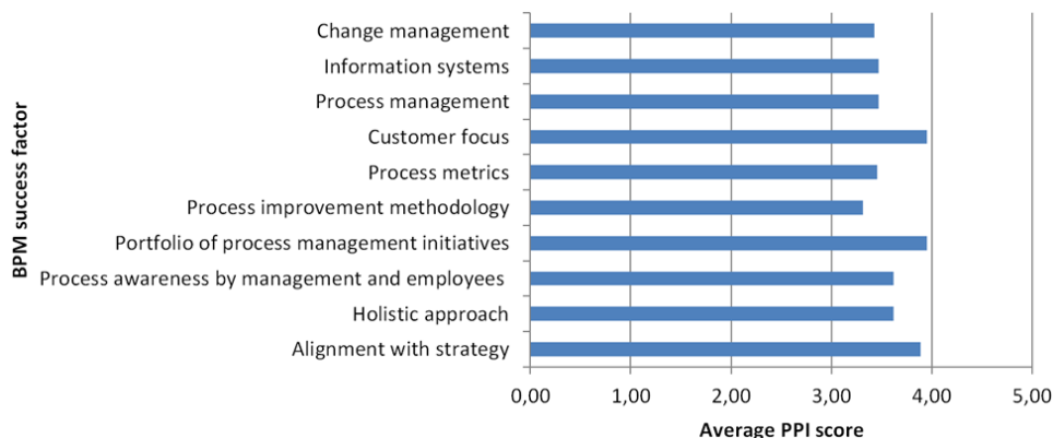
Fig. 1 PPI scores through BPM success factors in Croatian companies

The next section of the survey was concerned with the usage of social BPM within the observed companies. The total average of the social BPM scores for Croatian companies is 3.0 which clearly states that Croatian companies are somewhere in the middle of accepting, implementing and using social BPM. Since the usage of social BPM has been assessed through 5-point Likert scale, for the purpose of this research, those grades have been classified into three levels: (1) average rounded grades 1 and 2 are representing low level of social BPM usage, (2) average rounded grade 3 is the middle level of social BPM usage, while (3) average rounded grades 4 and 5 are representing high level of social BPM usage in a company. When looking at the observed companies' individual assessment of the social BPM usage, most of the companies (41.77%) have average grades above 3, which puts them in high level group of grades. This means that most of the surveyed companies in Croatia follow social software principles in their BPM practices. Average scores through levels set for this research are shown in Table III.