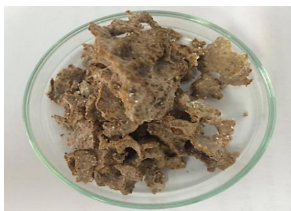
Fig. 2 Fungus comb of Macrotermes sp.

Cultures were inoculated in malt extract broth (malt extract 20 g/L, sucrose 20 g/L, peptone 6 g/L) supplemented with 25 µg/mL of chloramphenicol to avoid bacterial contamination. They were grown under aerobic conditions at room temperature (25±1°C) with shaking at 150 rpm for 7 days. The cultures were then stored at 4°C pending further study.