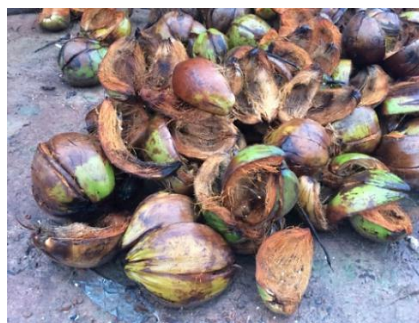
Fig. 1 Coconut coir from coconut palm orchard in Thailand

Coconut palm ( Cocos nucifera L.) is an important economic plant in Southern Thailand. Thailand is the world's sixth largest producer of coconuts with a coconut palm plantation area of around 206,000 hectares. Thailand produces coconut oil, coconut milk and activated carbon of around 1,960, 179,297, and 8,829 million tons per year, respectively. Biomass waste as coconut coir results from the processing units of the coconut industry at 37,704 million tons per year [3].